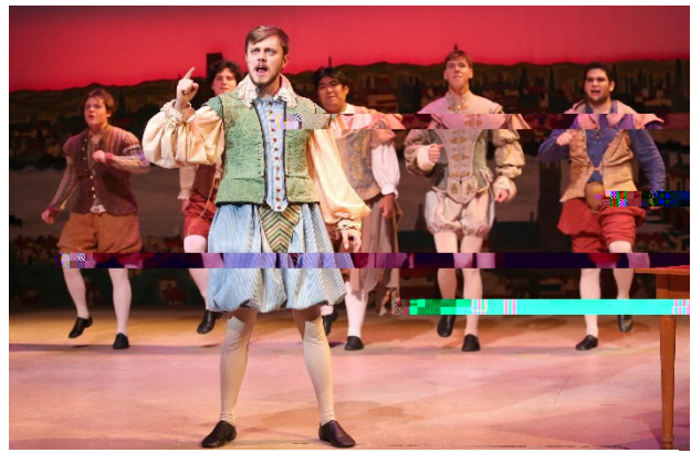
Fall Theater Production: Something Rotten!