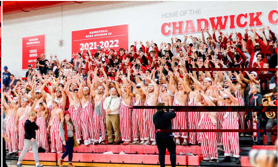
Wabash vs DePauw Basketball 12/29/23