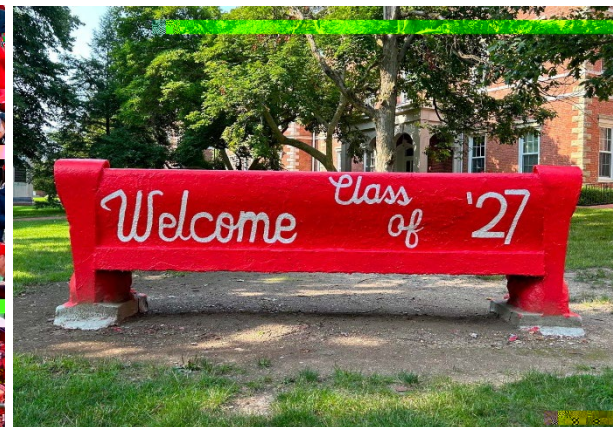
The Senior Bench welcomes the newest class of students