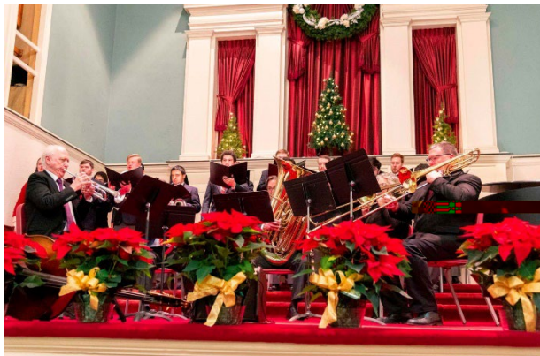
The 55th Annual Christmas Music and Reading Festival